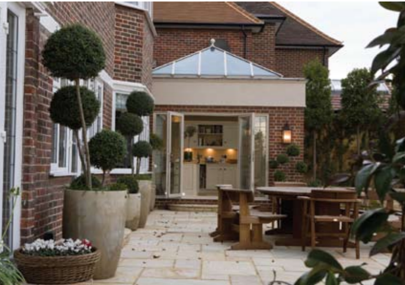
The magnificent Orangery flows seamlessly into a stunning outdoor living space.....

Take this magnificent Orangery that we have just completed containing a stunning kitchen and set in a beautifully landscaped garden.