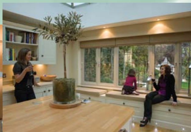
Time to relax...