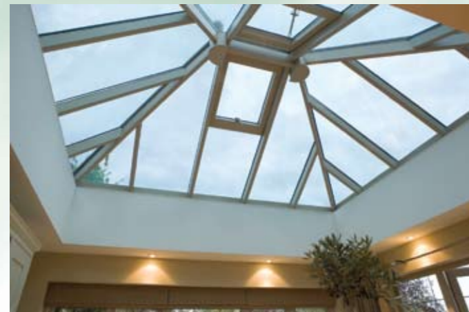
The spectacular Orangery roof