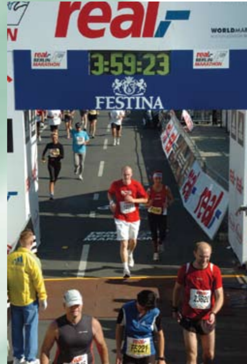
The finish....under 4 hours!