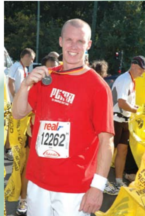
Well done Tom