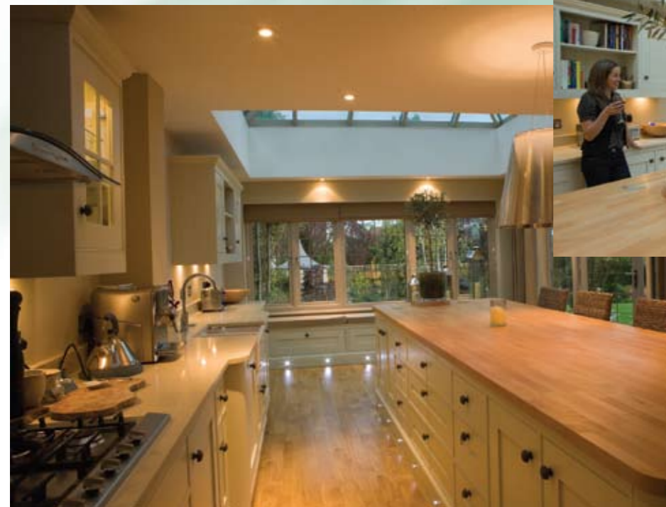
A kitchen with the 'wow' factor