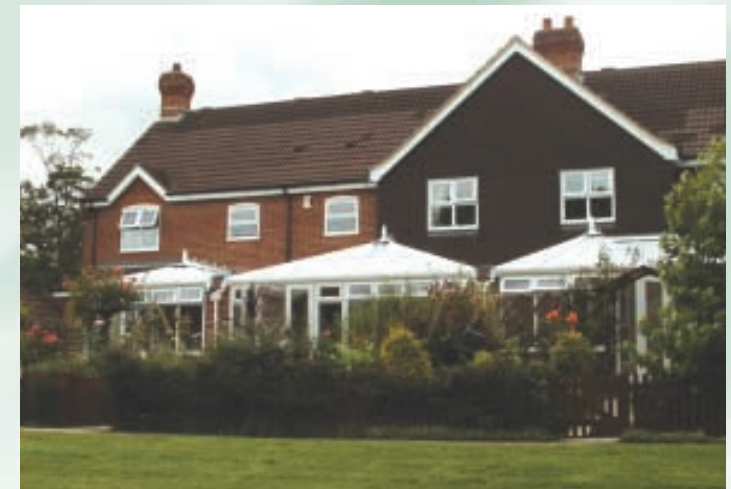
Sherborne's three in a row!

Each has been individually created but within an overall concept to ensure a consistent design approach.