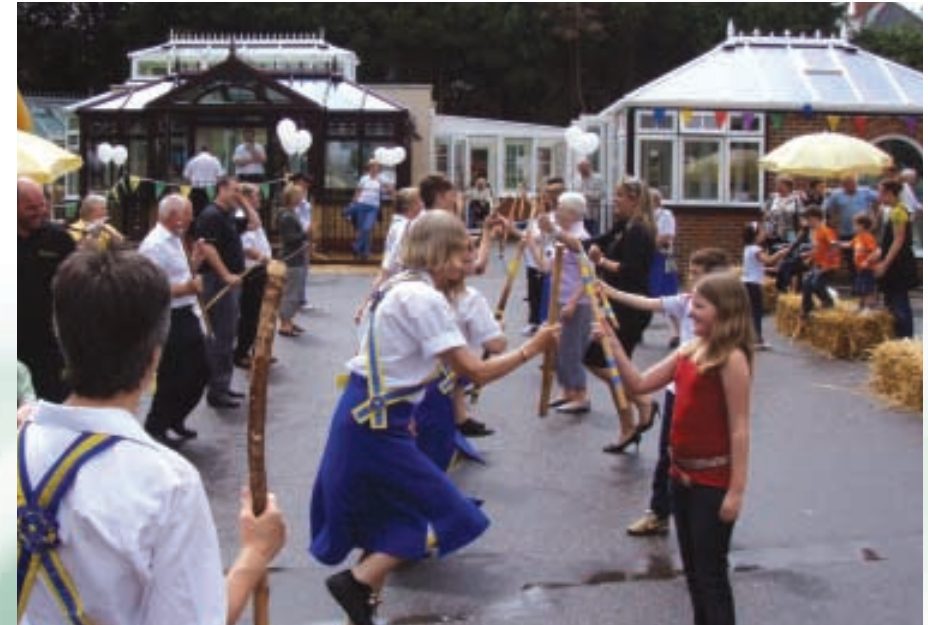
So this is what happens when you drink Scrumpy!!

We'll continue to update Windlesham with all the latest products as they come available but, for the moment, we will now turn our attention to our next showsite which will open later this year at the Wyevale Garden Centre at Sherfield on Lodden, near Basingstoke.