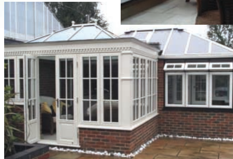
The Orangery at Windlesham Showsite