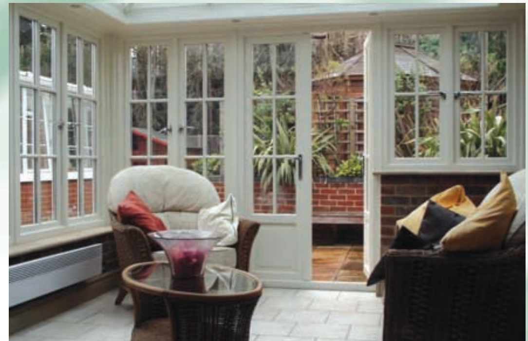
Inside the Orangery at Windlesham Showsite