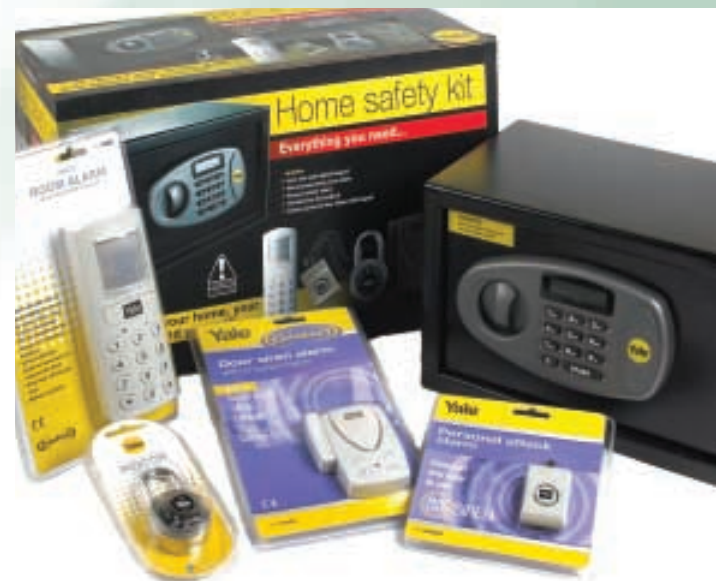
New security products

And that's not the end of it – in coming months we expect to be able to offer a unique range of beautiful furniture which we will be importing from China and displaying at our showsites.