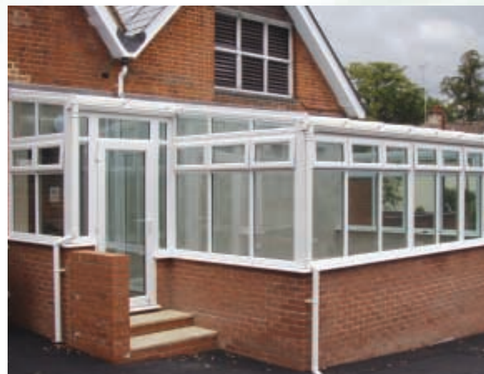
Sherborne's 'class' conservatory

Equally it's not everyday that we build a conservatory as a classroom extension as this one nearing completion at Windlesham Village Infant School. This had to be started and completed through the school holidays so we'll be interested to find out what the children think of it once term is underway.